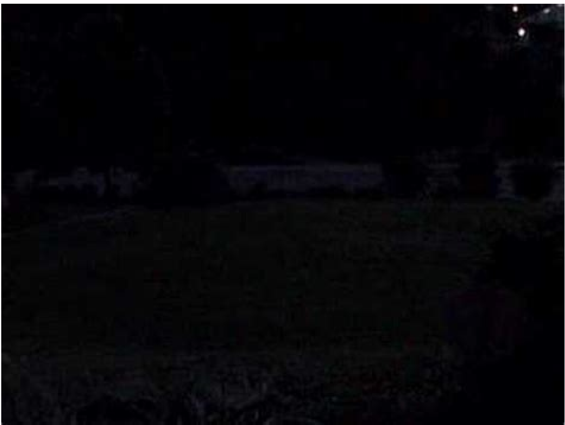
Where have all the lightning bugs gone